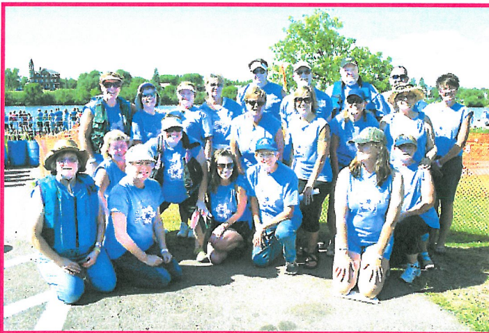
The Many Faces of Breast Cancer Team I