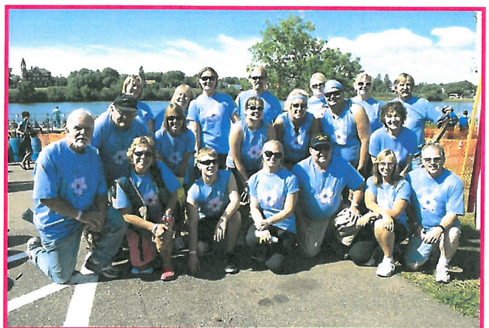
The Many Faces of Breast Cancer Team II

Circle of Hope, Inc. is located out of Duluth, MN and serves both northern Minnesota and northern Wisconsin. It is a 501(c)3 charitable organization serving the public interest of helping clients (any gender or age) in poverty and those in financial distress from a breast cancer diagnosis. Its primary mission is to provide block grants (or payments) to clients for their breast cancer treatment medical bills related to surgery, oncology/chemo, radiation, dental work (related to chemo) and prescription loophole drug coverage. Also, lymphedema expenses are covered.