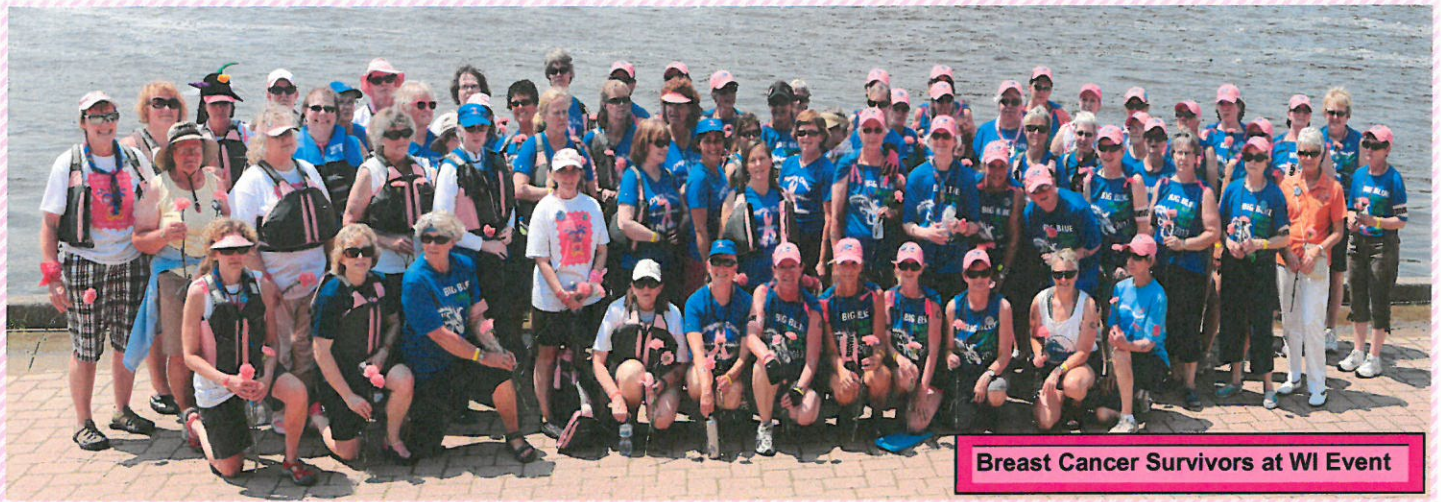
Breast Cancer Survivors at WI Event

The Breast Cancer Survivors all gather by the water for the Flower Ceremony in a time to remember and share.