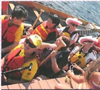
August Race, Lake Orion, Michigan (Bronze)