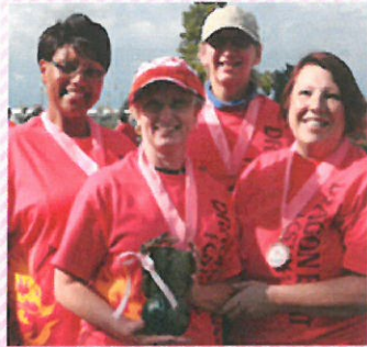
September Race, Cleveland, Ohio (Gold)