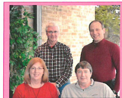
Good Luck in Sarasota BCS Teams!

The Annual Meeting concluded with other business including a history of the ADBA, ADBA mission statement discussion, an explanation of Membership dues, and a request for new ADBA volunteers. With no further business, the meeting adjourned.