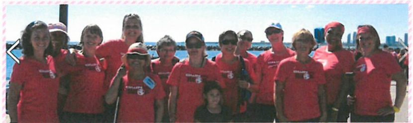
September Race, Toronto, Canada (Silver)

The Motor City Dragons Team formed in Dearborn, Michigan within Ford Canoe & Kayak Club (FCKC), a member of Ford Employee Recreation Association (FERA). Ford Warriors in Pink is powering the Motor City Dragons (MCD) team and provided team uniforms for those who paddled in three festivals, in addition to dress shirts!