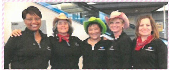
Having fun at the "Cattle Barron's Ball"

There were many firsts for the Motor City Dragons in 2013 which helped our team bond: