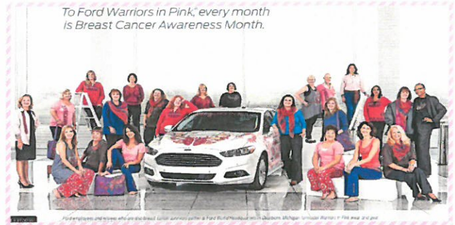
For the Ford Warriors in Pink, every month is Breast Cancer Awareness month.