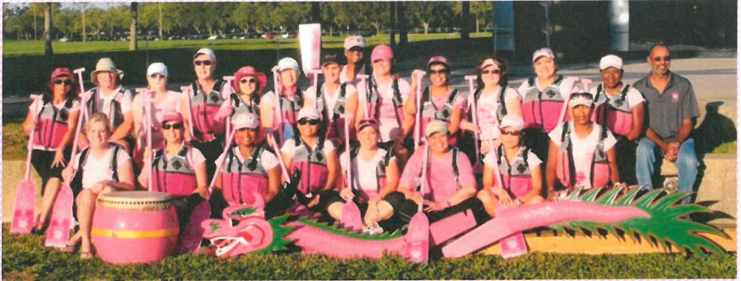
Pink Phurree BCS Dragon Boat Team

Pink Phurree managed to continue its evolution in 2013. As has been our history, our growth was slow, but steady. We finished the year with 6 new members who joined us on the boat for our last race of the year in Sugar Land, Texas. For the first time, we competed in the 2000 meter race and finished with a respectable time. So immensely proud of those ladies who had managed only one or two practices before joining the team, but they all did very well.