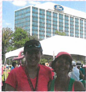
Komen 3-Day Walk